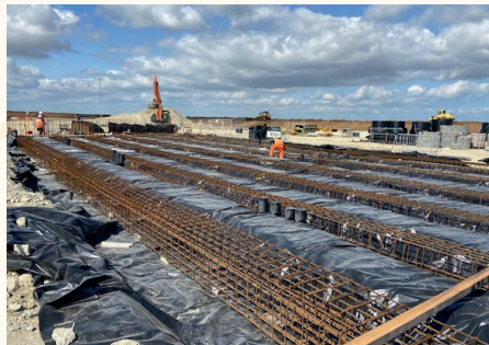
Electrical area within bund

The boundary fence is due to be completed by mid-September.