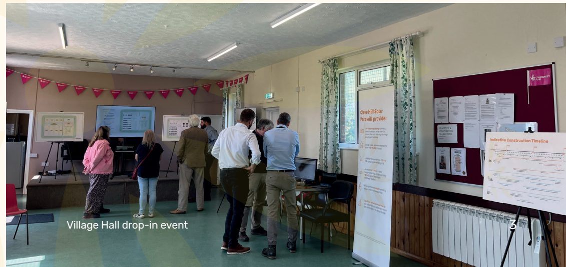
Village Hall drop-in event

The project team were on hand to answer questions at two drop-in events held at Graveney Village Hall on 8th and 9th August. Around 45 members of the public visited the events to discuss battery safety planning, general construction progress, traffic management and various other topics.