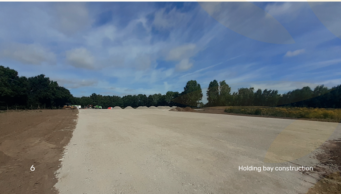
Holding bay construction

We welcome suggestions for improvements to traffic management issues during the construction of the Cleve Hill Solar Park. Please get in touch with the project team who will give feedback on all ideas, both to you and the Traffic Management Group.