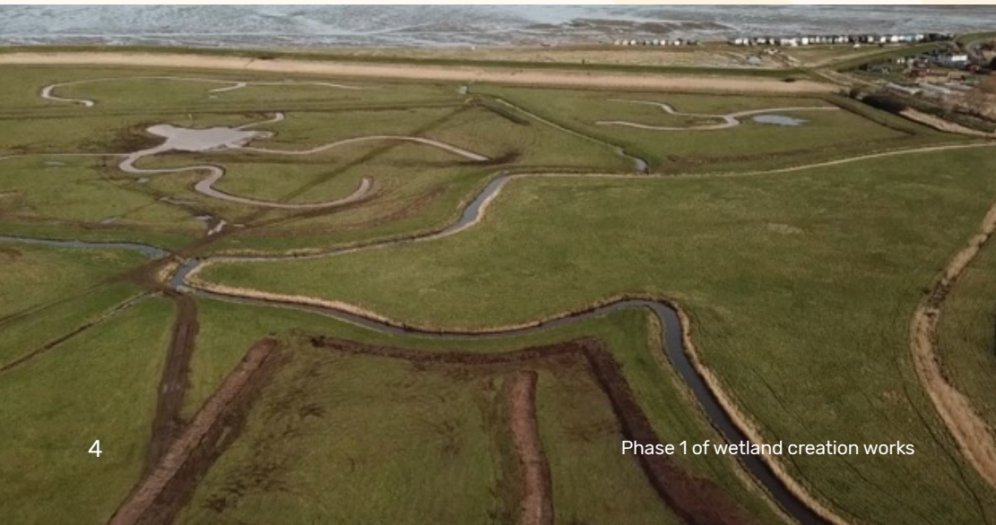
Phase 1 of wetland creation works

Our core site working hours are 07:00 – 19:00 Monday to Friday, 07:00 – 13:00 Saturday.